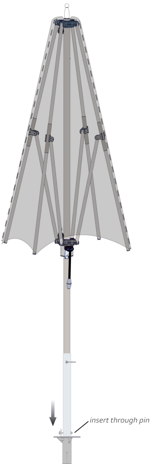
b with in-ground flush mount