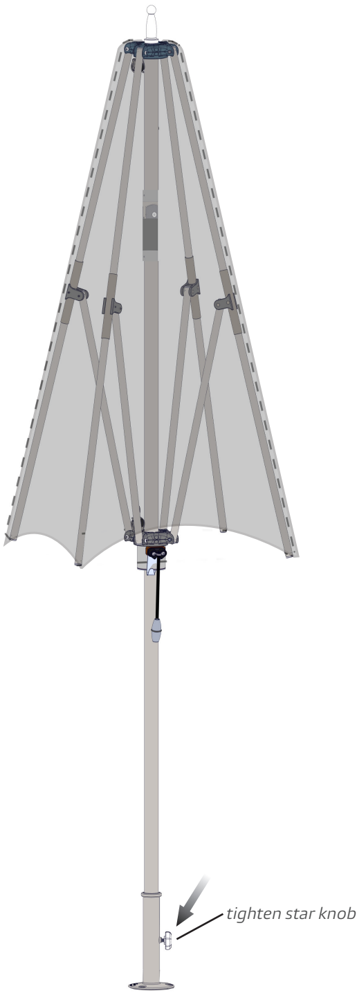
a with above ground base