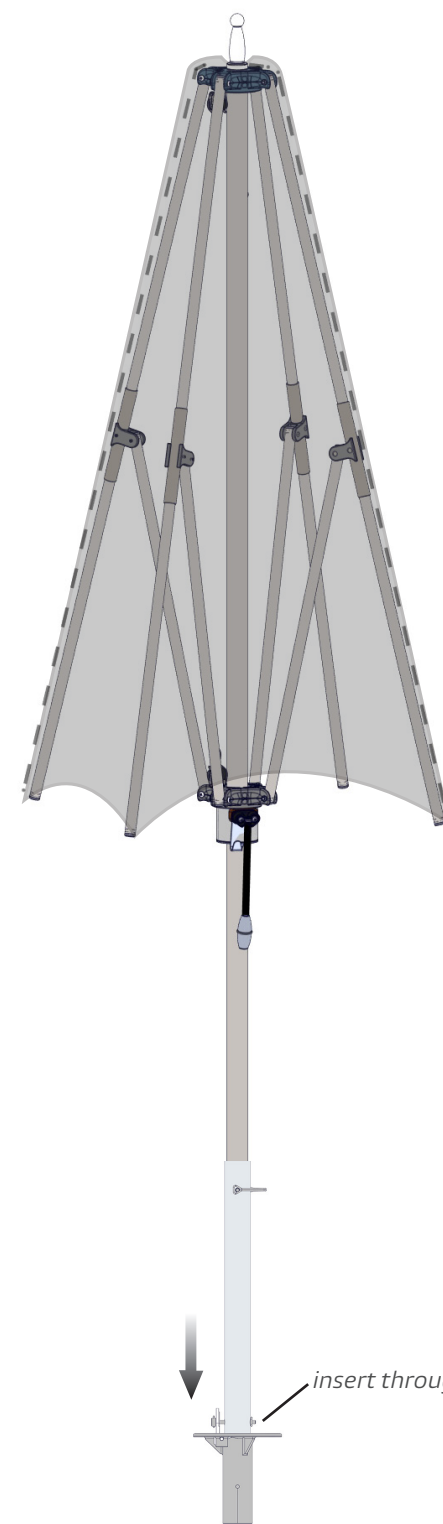
b with in-ground flush mount